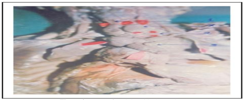
Figure-2: Human foetal thyroid. (29 weeks)