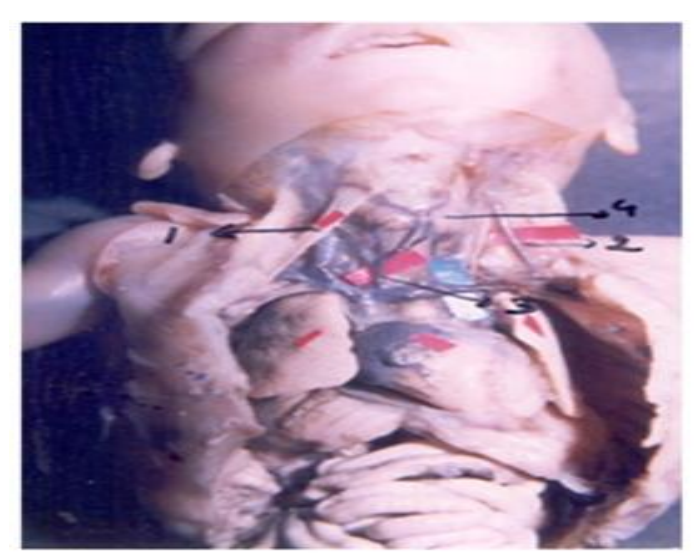
Figure-3: Human foetal thyroid. (26 weeks)